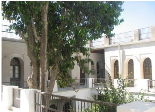
Figure 1: residential home in humid and hot climate

In this climate, buildings have central yard and they are middle introverted. Rooms are located around central yard. General difference of these central yard buildings with similar cases in central plateau of Iran is that although these buildings are middle introverted, their relationship with outer space is not totally closed, large and elevated windows and wide porches located to alley and/or they have field in second floors and particularly in third floors. Porch in this region is larger than other regions and very important space in the building. In hot seasons which continued half of year, most of routine activities performed in the porch because proper ventilation occurred in the porch and it is under shadow. Often, around central yard and in one or two sides out of building, there are elevated and wide porches.