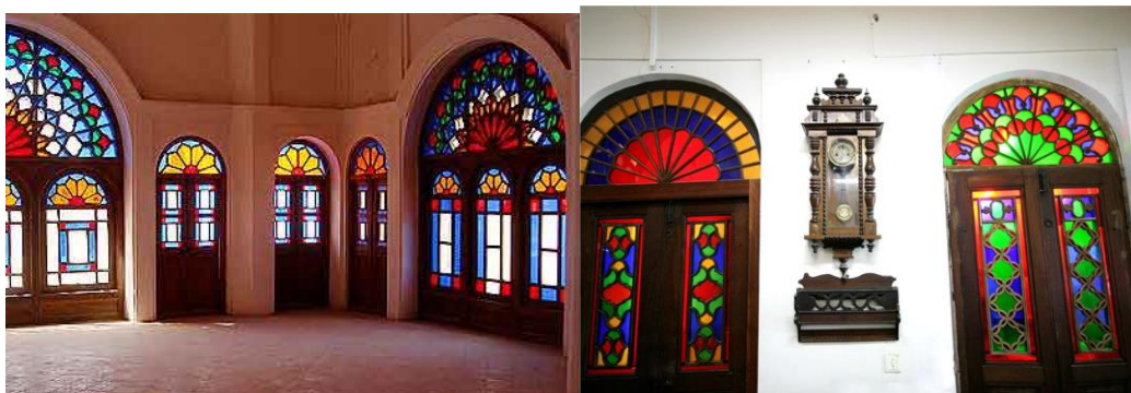
Figure 3: colorful glasses in residential building in Bushehr

In this climate, direct radiation of sun light increases temperature and interferes residents' convenience. Also, because of ground dryness, reflection of light by ground increases temperature of the region. Of actions which are employed by vernacular architecture to reduce this matter are use of central yard with low length and width and high height of wall for providing more shadow during a day, orientation of buildings back to sun, thin alleys with large buildings with shadow in a day, tallness of windows vertically, existence of wooden shutters, Mashrabiyas, porches and sunny to prevent from influence of sun light into building, use of colorful glasses with wooden frame and illuminating view of the building (Memarian et al. 2014).