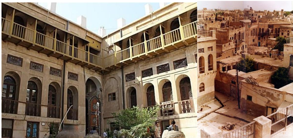
Figure 4: using mild brown colors (cob) in one of traditional homes of Bushehr and traditional texture of this city

The relationship among temperature and air and internal and external surfaces of building depends on color of external walls, type of used materials for dimensions of windows and quality of shadings. Amplitude of internal air can be reduced. In the case of using party walls with low thermal and capacity resistance and dark color of external surface or use of large windows without shading, temperature of internal air will be more than external temperature that this matter is considered properly in climatic architecture of humid and hot regions of Iran.