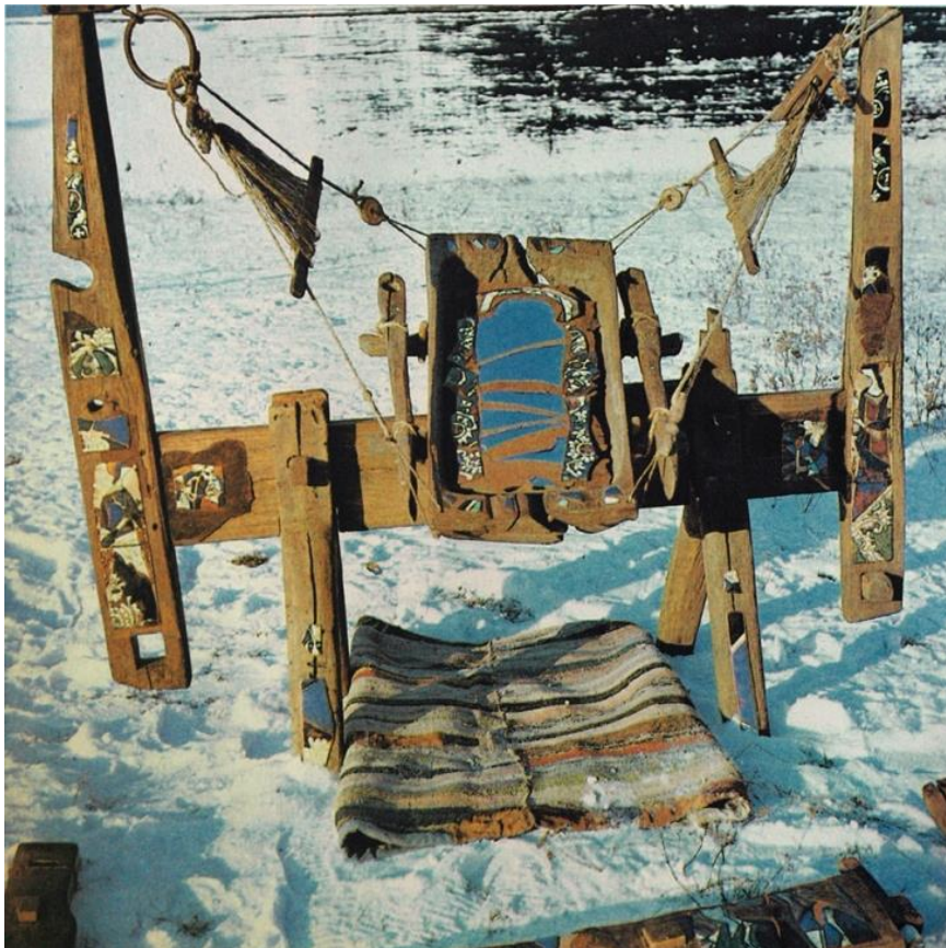
Picture 1: Olexander Borodai, " Cradle for Unborn Baby ", 1989, wood, copper, enamel, 120 x 30 cm. Museum of Ukrainian Painting. Dnipro (photograph from open sources).

All works of the artist, except for the external richness of texture and color, have an inner energy, a profound meaning that remains partially hidden. O. Borodai said that his picturesque enamels resemble a multi-layered cake, where the content, as a substrate and texture, is gradually strung through personal experiences (Sedyk, 2019: 141). The author's approach, in which the modern conceptuality of the artist is combined with tradition, which goes back to the roots of national culture, gives the enamel a truly classical sound.