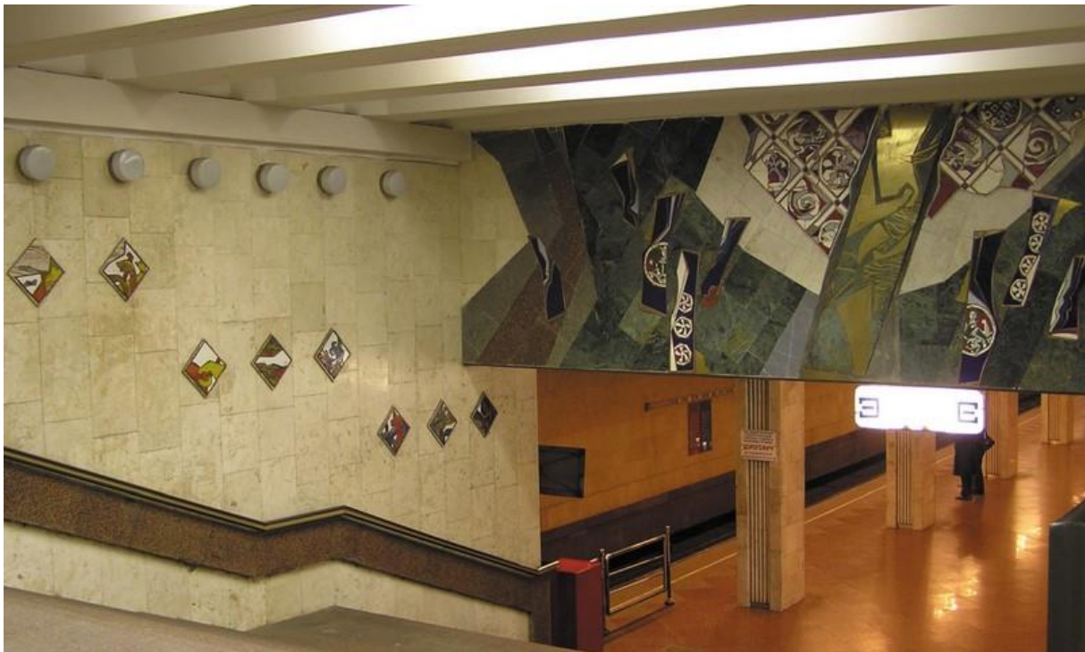
Picture 2: Olexander Borodai, Olexander Babak, 1991, "Echoes of the past" , copper, enamel, marble. Composition at the metro station "Vydubychi", Kyiv. Fragment. 200 x 800 cm. (photograph from open sources).

While designing the Vydubychi metro station, O. Borodai turned to Kyiv-Russian themes. In co-authorship with O. Babak, he realized the series "Echoes of the Past" (1991, copper, enamel, marble, 210 x 700) in which in symbiosis complement each other different enamel surfaces, polished brass, granite and various types of marble, combined on the principle of Florentine mosaic. That is, each piece of stone was adjusted to each other with the highest accuracy so that their joints were not visible (Picture 2).