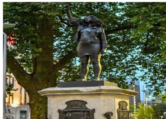
Image D. Edward Colston's empty plinth has been filled with a monument to the BLM's activist Jen Reid titled 'A Surge of Power'

Image B is undoubtedly of semiotic relevance and delivers effectively and unambiguously its representational and interpretational meanings. The image reveals Colston's figure lying on the ground and surrounded by the protesters. The photo focuses on Colston and a black man kneeling on the statue's neck and reproducing the brutal act by which George Floyd was killed. The symbolic signification points out racist acts of today within the historic context by reversing the scenario of Floyd's murder: the trader who participated in transporting black slaves from Africa to the USA is now strangled by their descendants, which also implies altering the whites' narrative that honors the whites' ancestors who oppressed, enslaved and exploited the blacks. The symbolic transfer of Floyd's death scene onto Colston's effigy is an interpretational indication of institutional racism and brutality towards the blacks and the continuation of this patrimony since the times of Colston and other slave traders who initiated it; it is a struggle of memory of the past for the rights of the present.