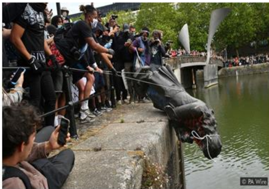
Image C. The statue of Colston is thrown into Bristol harbor during a Black Lives Matter rally