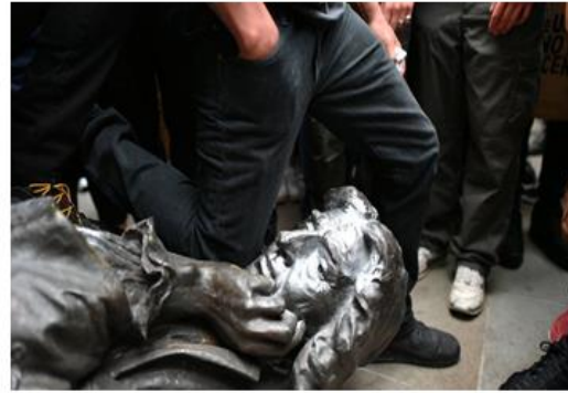
Image B. A protester with his knee on Colston's figure's neck mirroring George Floyd's death