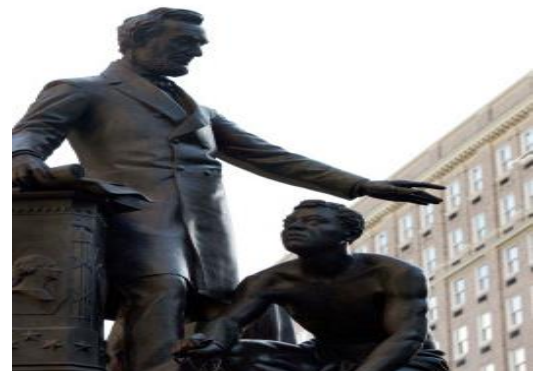
Image B. Boston statue depicts President Abraham Lincoln standing before a freed black man.

The arrangement of characters in the monuments, their poses, and actions serve as a permanent reminder and, thus, the perpetrator of the black’s submissiveness and white superiority in the collective transgenerational memory of the oppressed communities. Therefore, driven by the killing of Floyd, BLM activists’ actions are presented in what Traverso (2020) calls an “iconoclastic fury” revolutions usually retain. Such an iconoclasm expresses an unconscious tendency to deny the past and always triggers resentful reactions (ibid.). Hence, the BLM’s protests and actions against such iconized figures can be understood as a struggle over memory, ideology, and history; to erase the past history of inferiority, oppression and racism, and constructing a new reality based on human rights and racial equality.