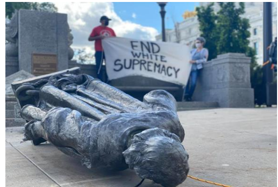
Image B. Statue of Christopher Columbus, which was toppled by protesters in Richmond

From the point of view of CDA, targeting the statues of the explorer aims at deconstructing exclusionary ideologies with “hidden dimensions of power, control, injustice, and inequity” that “appear to be commonsense assumptions of social reality and ‘truth’” (Strauss & Feiz, 2014, p. 313). The protesters try to reformulate the ideological history based on white supremacy, genocide, and exploitation and start a new national discourse based on dehumanizing the celebration of white criminals, exploiters, and colonizers and, therefore, on the revival of racial equality. In other words, this action marks an attempt to deconstruct the discourse from the point where it began in the past and to replace it with a new one for the present.