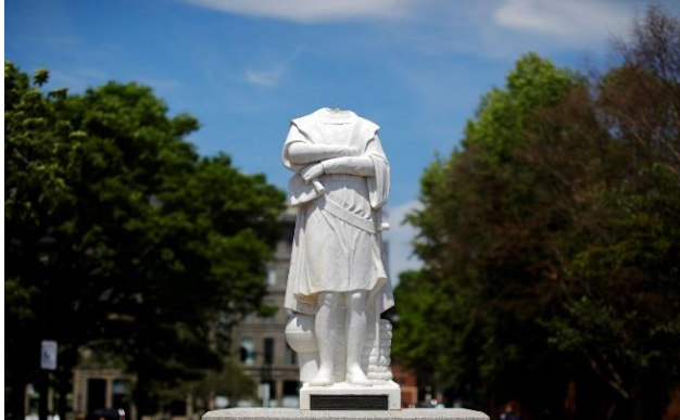
Image A. The head of a Christopher Columbus statue pulled off amid protests against racial inequality in Boston.