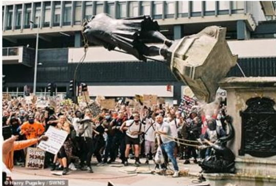
Image A. The statue of Edward Colston pulled down from during a Black Lives Matter protest rally in Bristol city Centre (AAP)