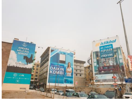
Image 15: Example of the Opera Square Building Facade Advertising Posters

Located in the middle of Ulus, which was formerly the center of Ankara, and Kızılay, which is the favorite center of Ankara, Opera Square is very important for Ankara as it used to be. Due to the fact that there are structures belonging to the first years of the Republic around, it has always been the focus of interest for local and foreign tourists, especially for cultural tours. Image 14 is located in Opera Square.