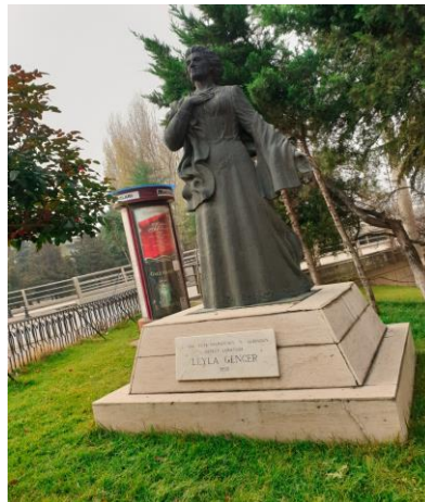
Image 16: Example of Leyla Gencer Statue and Cylinder Advertising Tower (Opera House Entrance)

It is an effective and preferred area for advertisers that these large-sized channels used in the deaf walls of buildings are clearly visible in many aspects of Opera Square. These channels, which aim to change the purchasing behavior by affecting people who are active outside, which have become the slogan of outdoor advertising, can reach consumers who continue their daily routine lives without difficulty. Among the advertisements that have spread to the square, the most effective and easily accessible building facade are advertising posters. Building facade advertisement posters are a versatile communication area both in terms of covering the unused and non-functional surface of the building and promoting the product to the target audience. The fact that these advertisements produced from portable materials such as tarpaulins can be changed more easily is an outdoor advertising medium preferred by both advertisers and advertisers.