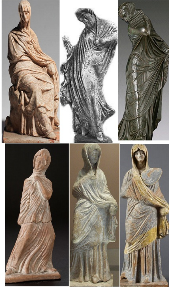
Picture 10. Various Tanagra Figurines ( http://archaeologicalmuseum.jhu.edu/the-collection/object-stories/archaeology-of-daily-life/tanagras/terracotta-bride-dancer/ ); ( http://belly-dance.org/tanagra.php ), (Eriřim Tarihi 28.05.2015).

The figurines discovered in Aigai region, on the other hand, depict the figures with buns; at some specimens, on the other hand, the hair is visible on the forehead (Picture 11).