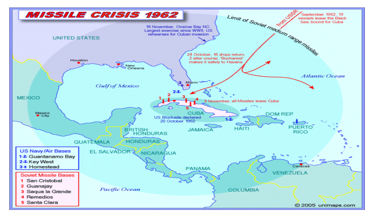
Figure 3. Range of Missiles.