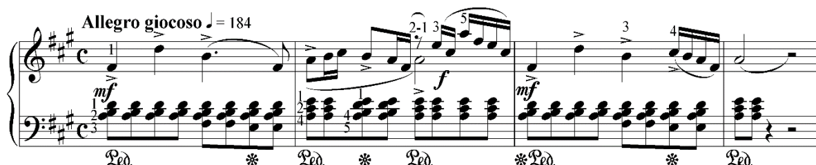
Figure 9. R. Yakhin "At the festival"

The rondeau performs function of the final in R. Yakhin's cycle "Summer evenings" and is dynamic top Scherzo-genre lines (Spiridonova, 1997, p.33).