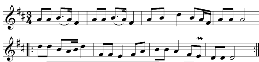
Figure 1. Melody of the song "Native language"

The Tatar folk song "Native language" written on verses of the great Tatar poet Gabdulla Tuqay, sings of beauty and richness of the native language, represents inseparable communication of the person with his house and close people, a perennial spring of inspiration and hope (Figure 1).