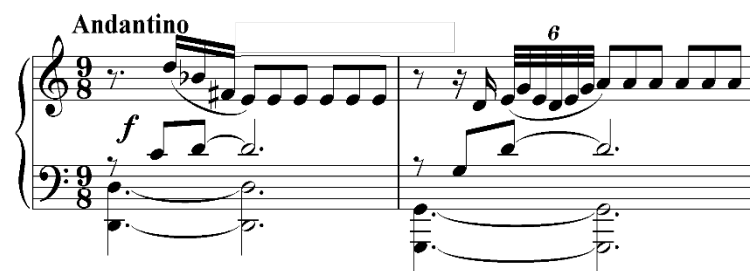
Figure 10. F. Yarullin "Scene" from the suite "Shurale", F. Hasanova's transcription (bars 1-2)

During creation of a musical portrait of Shurale composers use characteristic musical means: chromatism and the discording accords, the emphasis, sharp change of dynamics, polyrhythm and tempo contrasts transferring animal habits and rage of the forest devil.