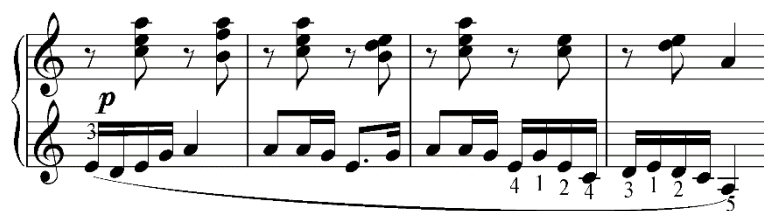
Figure 6. "Nightingale pigeon" (bars 13-16)

The finishing carrying out a melody in a lower case in unison is a peculiar semantic culmination of the play.