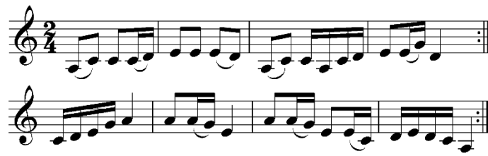
Figure 4. Melody of the song "Nightingale pigeon"

As sings in a garden in the spring Ringing nightingale. Together we grew with you, Not to forget those days <...>