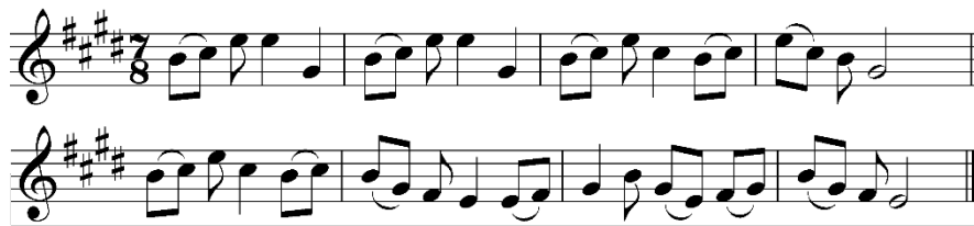
Figure 7. Melody "Bait of the Bulgar city"