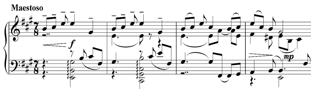
Figure 8. "Bait of the Bulgar city", Sh. Sharifullin's arrangement

Ecological representations of Tatars, the ideas of unification with the earth wet nurse and worship of the nature are reflected in a musical component of calendar holidays and ceremonies.