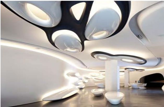
Picture 5. Mobility of water and positive energies arising from it by mottle forms to work in internal space Gallery in London in the year 2013

One of the forms of energy, energy generated by the physical form of life environment; whether this form is normal or made by man. Routs of access to doors in building for example can absorb the flow of energy (Walters, N.D.: 28). An interesting point in the physical form of space is Juana; when with entering a space, that space gives a message even sometimes too complex and hidden (Kang, M. Jet al 2017). The art of internal help philosophy, feng tools detect and transfer energy.