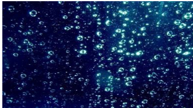
Picture 8. The use of wallpaper fountains for association of flow crystallization or drops of water

Like the previous patterns, this model is able to demonstrate the feel of flow and profit of positive energies of the element of water in interior design.