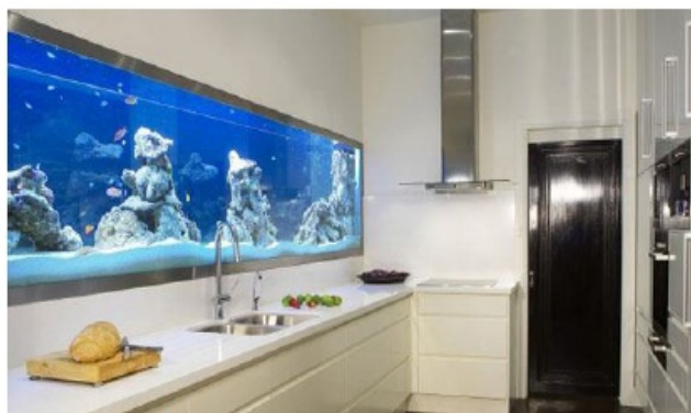
Picture7. Design and aquarium in kitchen decoration

When we talk about the design and decoration of internal space, we mostly refer to furniture, table, installation of wall papers and purchasing small and large decorations. But sometimes we can bring vividness to houses through aquariums while making it beautiful. Studies show that those who are sensitive and like to inject liveliness to their decorations starts with aquarium.