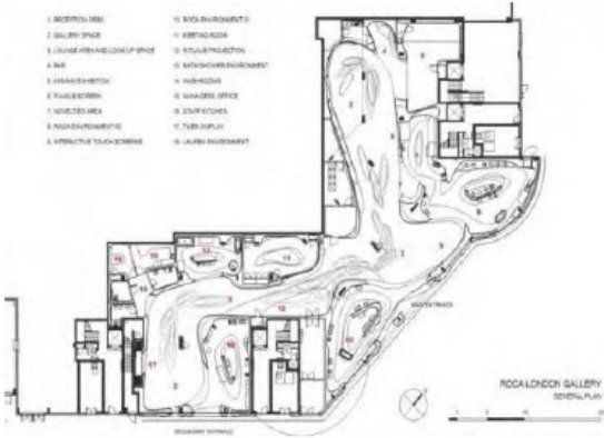
Figure 3. Planning Gallery in London in the year 2013 design forms and curve mottle walls in internal decoration to feel implied water flow