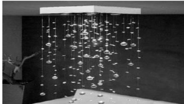
Picture 6. Imbuing concept or drops of water with the use of the form deeply the internal space house

recollections. Rear screen and crystals like water clear and open spaces behind them could see (Momeni, 2013); in other words to see and move not energy but also with the bore to display cursor to flow through the energy out into and vice versa surgical consult for example is with contour rear screen and suitable installation components and crystal lightning, light with energy flow to some regional voter characteristics desired guidance home. Crystals of the word Greek krustallos meant frozen light (ICE) derived and its attributes with the element of water similarity. As an incorrect schema other modern replace the water in the internal home means mirror (IIDA, 1999: 14).