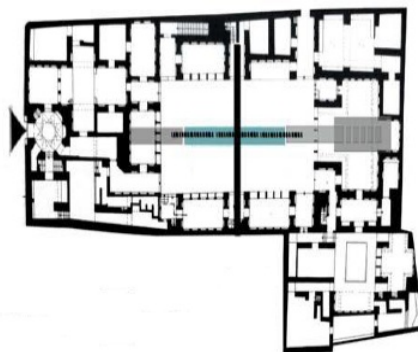
Figure 2. Master way house in Yazd