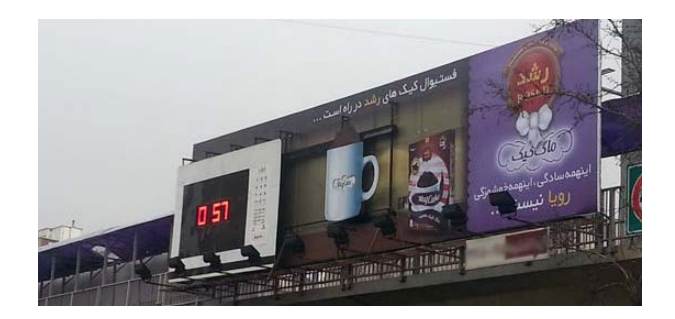
Roshd Cake advertising billboards (the image of oven and the prepared mug cake)