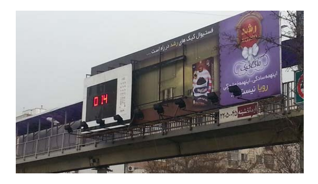
Roshd Cake advertising billboards (the image of oven and the prepared mug cake on the billboard)

In 2013 and before Iranian New Year, Roshd Food Industries implemented a billboard in Tehran to advertise its mug cakes. The Iranian food company did not satisfy with displaying a simple and non-animated image on its billboard. Due to the presence of mobility and communication element in this billboard, it is one of the rare examples of interactive billboards in Iran.