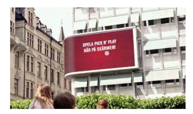
McDonald's Interactive Billboard

regard to geographic specifications of the mobile location, the customer is connected to the closest billboard. He has 30 seconds time to earn required scores and win some food receipts.