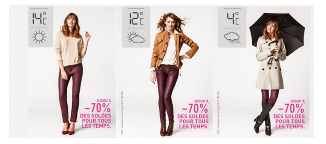
Pictures of models whose clothes and covering changes by temperature changes

The billboards are working directly with the climate; sensors installed on the panels change based on two criteria of temperature and precipitation so that when the temperature comes down, the clothes worn by the models on billboard will increase according to the latest company's products and its type becomes thicker and warmer according to its model. When the temperature goes up, the clothes will become less, and they will carry umbrella and changes her/his jacket and coat when it rains.