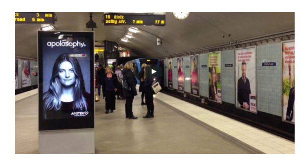
Interactive billboard of Apolosophy product in subway space.

A company manufacturing hair care products called "Apotek Hjartat" have invented a new way to introduce its products. In collaboration with advertising agencies of Akestam Holst and Stopp, Apolosophy brand implemented its advertising in Stockholm (Sweden) subway using the slogan of "Makes Your Hair Come Alive".