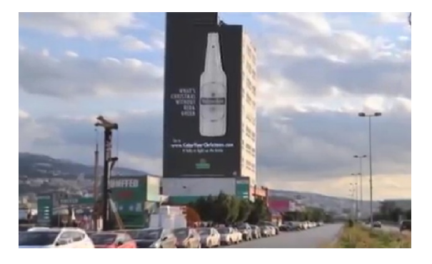
How is Christmas without the red and green? Click to turn it on.

The billboard will be turn on as users enter the website "www.coloryourchrismas.com", log in their pages in personal social pages (like Facebook), and confirm their names in the website to illuminate a green bar on the bottle. In this way, each user would have a partial role in the illumination of the entire great bottle.