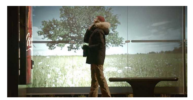
Turning Coca-Cola board on and spread of summer landscapes and images

In this creative performance, turning on automatic Coca-Cola machine lights attracted the passengers' attention. Then, some pictures of beautiful summer scenery appeared for them and they hear the sound of birds. Moreover, pictures of beautiful flowers moved following in passengers' footsteps in front of them. It reminded them summer warm in cold winter. At last, Coca-Cola presents them a free drink.