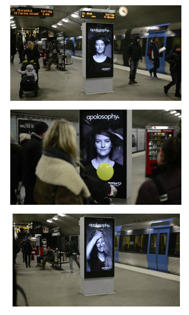
Different parts of Apolosophy interactive billboard's movement in metro areas

After this stage, the woman's face looks at visitors; she seems happier as she had a sweet smile for better communication to audiences; the audiences were all people passed the billboard.