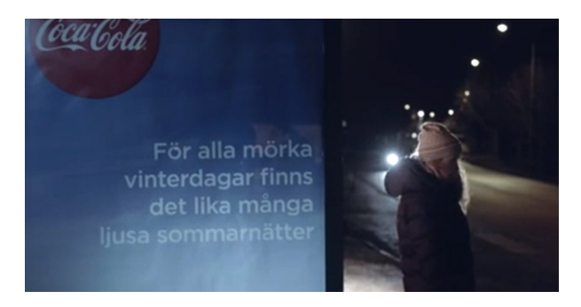
A person standing at the bus stop in Switzerland

Coca-Cola Happiness Machine had found its particular place in cold winter at a bus stop in Switzerland. In this urban advertising campaign of Coca-Cola named "Reasons to Believe", passengers waiting in bus stop did not expect Coca-Cola to bring them summer heat.